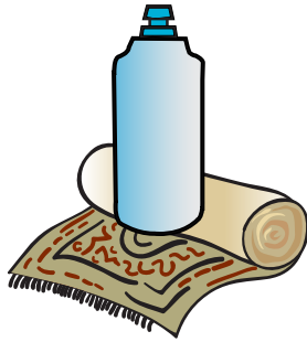
CODE 4 (LDPE)

Municipalities often differ on whether to accept products labeled with Code 4 and Code 5.